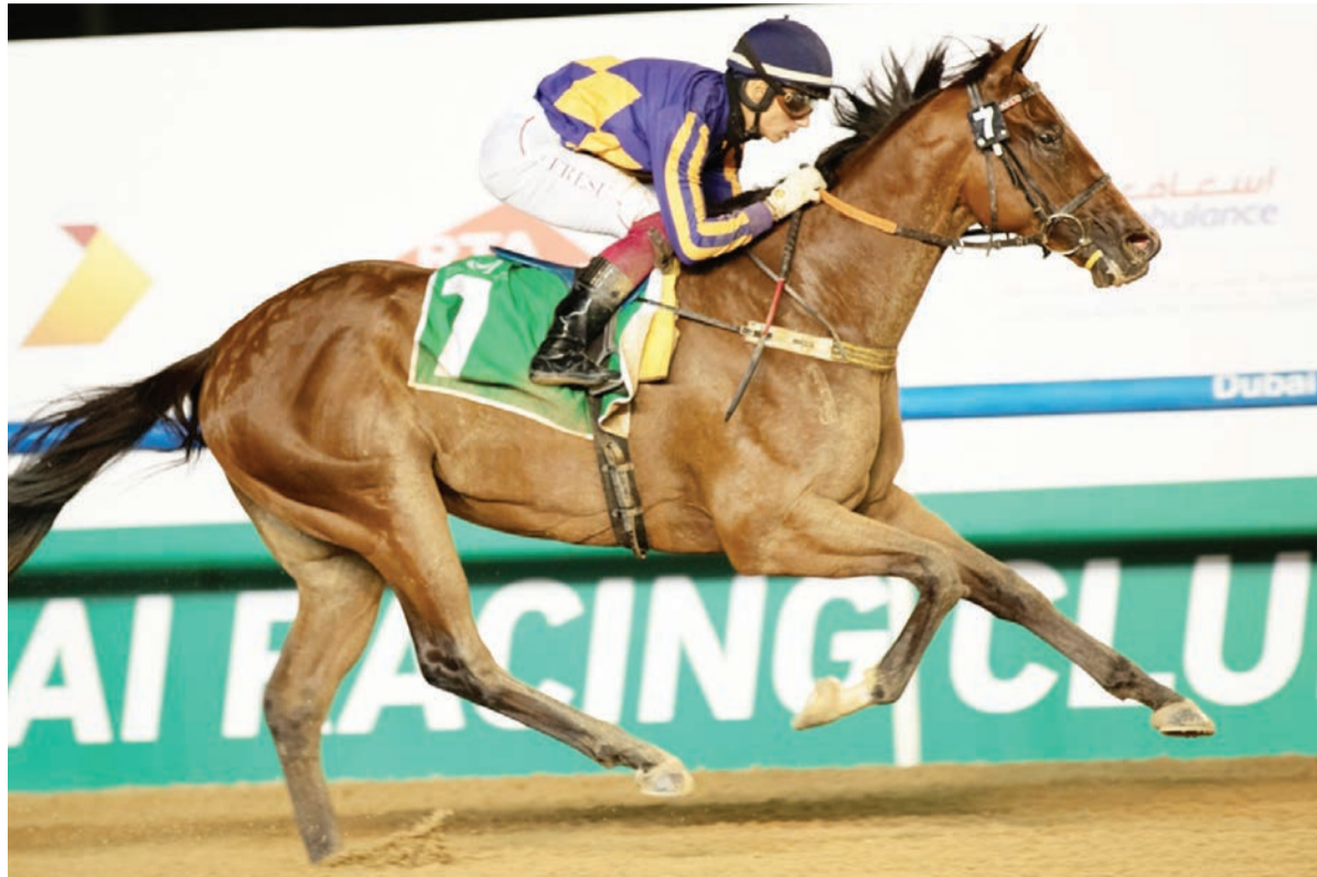
FEATURE PROSPECTS. Vasari is one of the favourites to land the DP World Sprint at Meydan Racecourse in Dubai today.

Leading Spirt, trained by Bhupat Seemar, is the choice of stable jockey Tadhg O'Shea of the three